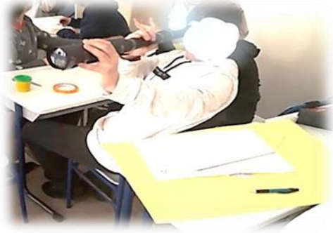
1. Telescope Design