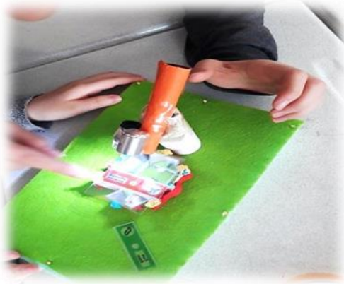
3. Microscope Design