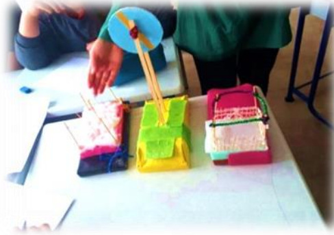
2. Air Filter Design