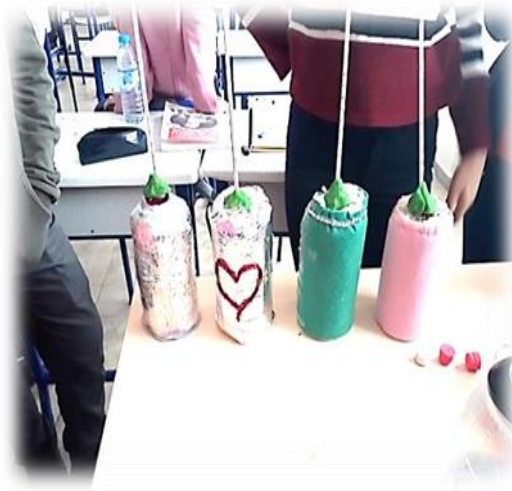
4. Thermos Design